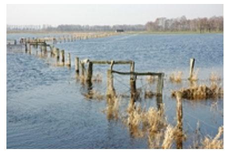
Wet grasslands in winter

50 weirs help to block 80km of ditches. The rewetting can therefore be controlled on various levels. The water level and the duration of the blocking are different in the individual areas. This means that different waterlogging situations can exist in the gross area, which meets the diverse