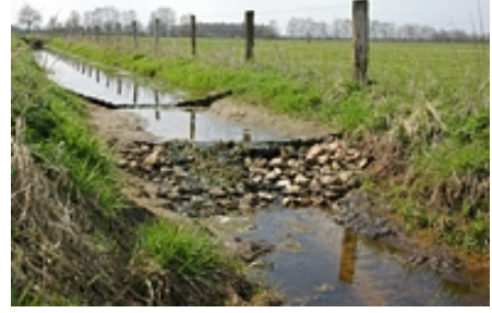
Damming of overflow

requirements of all meadow bird species. Snipe and ruff for example breed in spring and prefer extremely wet breeding places, while the curlew needs less wet areas.