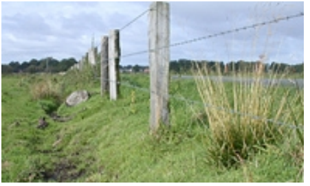
150 km of new fences were built