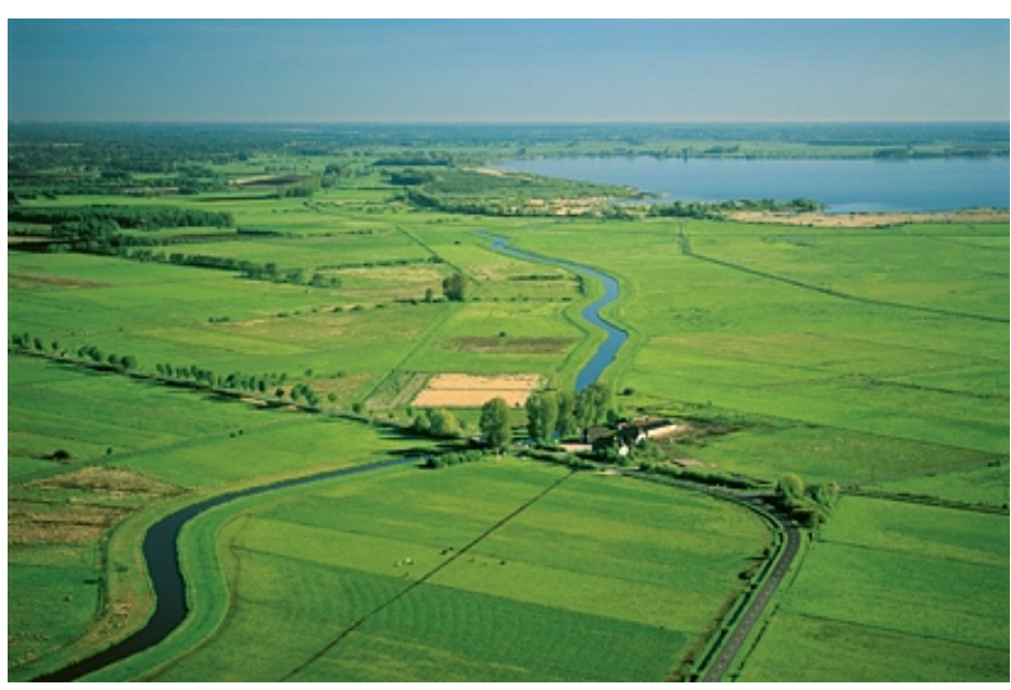
Lake Dümmer lowlands

In 1953 dikes were built on the Hunte and Dümmer banks. The surrounding fens were drained and agricultural use was intensified. The use as farmland led to the oxidation, reduction and degeneration of the turfs in the fens. The populations of many breeding and resting birds decreased or disappeared entirely.