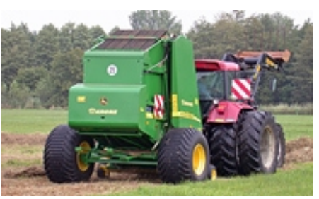
Baler with special tyres