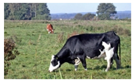
Grazing in wet grassland

150km of new fences were built in the grassland areas. This ensures that even areas which can hardly be used commercially continue to be used by the farmers and are well maintained.