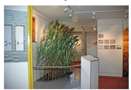
Permanent exhibition in the conservation centre

In the nature conservation centre Naturschutzstation Dümmer a new permanent exhibition was established. Through partially interactive facilities visitors can learn about the development of the Dümmer lowlands and their significance for inter-